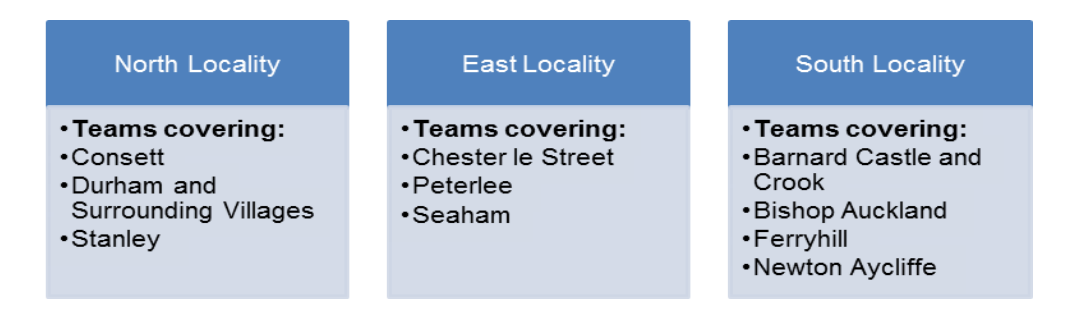
Table 1: One Point Locality and Hub Location

Youth Service provision currently includes open access youth sessions available to all young people as well as a smaller amount of targeted youth support developed by the One Point Service, offering early help to young people aged 13 – 19 years who are identified as having additional needs.